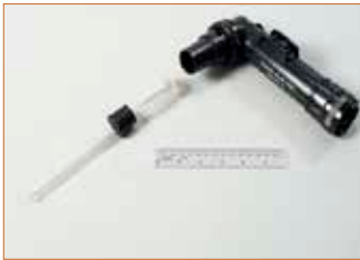
Aspirator, 1.5V Powered, NSN 3740-01-210-2368

Resting Stations: Many species of mosquitoes are inactive during the day and may be found resting in dark, cool and humid places protected from the wind. Comparative data on the densities of adult mosquitoes may be obtained by daytime inspection of these natural resting sites. Resting mosquitoes can be collected using a variety of devices such as vacuum aspirators, sweepers, suction traps, and hand-held, battery-operated flashlight aspirators.