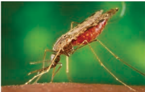
Anopheline Mosquito Resting Position.

by their typical resting position: males and females rest with their abdomens sticking up in the air rather than parallel to the surface on which they are resting.