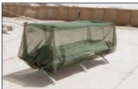
Insect Net Protector (Mosquito Bed Net Not Treated With Permethrin), NSN 7210-00-266-9736.