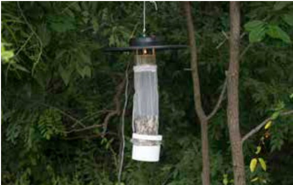
CDC light trap. Christina Graber, APHC

species present and their relative abundance. Information obtained from adult surveys includes: (1) determining the need for a control program, including when and where control measures should be applied and by what method; (2) determining if a disease potential may exist and (3) evaluating control measures previously applied. The CDC light trap provides a reliable and portable sampling device for the collection of mosquitoes. These traps are small, lightweight, and battery-operated. Carbon dioxide can be supplied by a regulated compressed gas container or through placement of dry ice in a padded envelope or insulated container that is suspended above the trap. Ideally, several CDC traps should be used in an area to conduct mosquito surveillance.