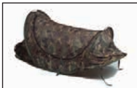
Permethrin-Treated Lightweight, Self-Supporting, Pop-Up Bed Net, NSN 3740-01-516-4415 OD Green.