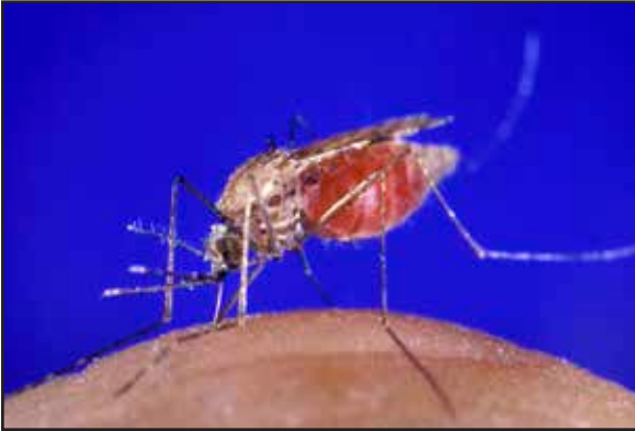
Anopheles spp. Mosquitoes, Vectors of Malaria.

Anopheles mosquitoes (image below) are primarily nighttime biters, including evening and early morning. Malaria cannot be transmitted from person-to-person like a cold or the flu. You cannot get malaria through casual contact with an infected person such as touching or kissing a person with the disease. Rarely, transmission occurs by blood transfusion, organ transplantation, needle sharing, or congenitally from mother to fetus. Medical personnel should use standard precautions when in contact with malaria-infected patients. Utilize environmental controls to ensure patients are not exposed to mosquitoes.